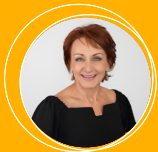
Dr Niki Vincent, Commissioner for Equal Opportunity (South Australia) & Chair, Australian Council of Human Rights Authorities

The City of Port Adelaide Enfield is delighted to be the first South Australian Council to sign up to become a supporter of the Spirit of Woman "The Place of Courage". Through collaborating with Spirit of Woman and other local Councils to develop this important contemporary commemorative public art space, we not only honour women who have passed as a result of domestic and family violence, we also help to create a positive place of contemplation, courage, resilience and change. Supporting this initiative is just one of the many ways PAE demonstrates our commitment to putting an end to domestic and family violence in our community.