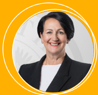
Hon Vickie Chapman MP, Deputy Premier and Attorney-General

I am proud to be associated with Spirit of Woman as their Patron. The Place of Courage will be South Australia's first dedicated contemporary commemorative public art space to not only honour women who rest in peace but also be a place of contemplation and remembrance, giving courage, strength, hope and healing. We are committed to a State response in the prevention, awareness raising and commemorating the survivors of domestic and family violence. This can only be achieved with the support of the community. Many people want to do something about family violence but are unsure how to make a difference. This is a tangible way to assist and I urge you to consider making a donation to assist in this truly groundbreaking venture.