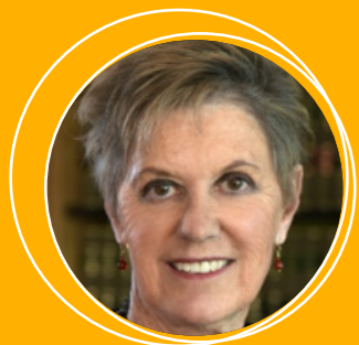
The Honourable Diana Bryant AO, QC

I am proud to be associated with Spirit of Woman as their Patron. The Place of Courage will be South Australia's first dedicated contemporary commemorative public art space to not only honour women who rest in peace but also be a place of contemplation and remembrance, giving courage, strength, hope and healing. We are committed to a State response in the prevention, awareness raising and commemorating the survivors of domestic and family violence. This can only be achieved with the support of the community. Many people want to do something about family violence but are unsure how to make a difference. This is a tangible way to assist and I urge you to consider making a donation to assist in this truly groundbreaking venture.